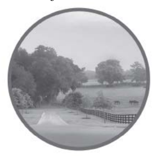
UNITED STATES EQUESTRIAN FEDERATION

"C" Children's Horse, Children's Pony, Adult Amateur, Pre-Green Hunters, Small Hunters, Hunter Breeding, Pony Hunter Breeding